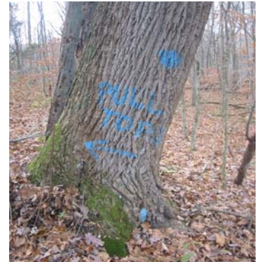
A tree marked for logging in Harrison-Crawford SF Compartment 28, Tract 8. Some areas marked are within 5 miles of one or more hibernacula of the federally-endangered Indiana Bat, Myotis sodalis .