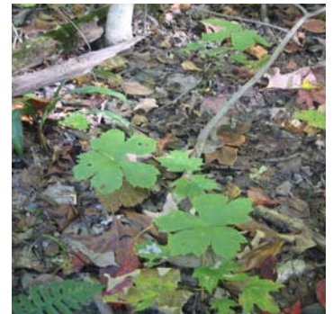
Goldenseal, a rare plant species, was found in the Harrison-Crawford SF logging area. Environmental Assessments are required by law in order to provide a complete evaluation of rare and endangered species like Goldenseal.